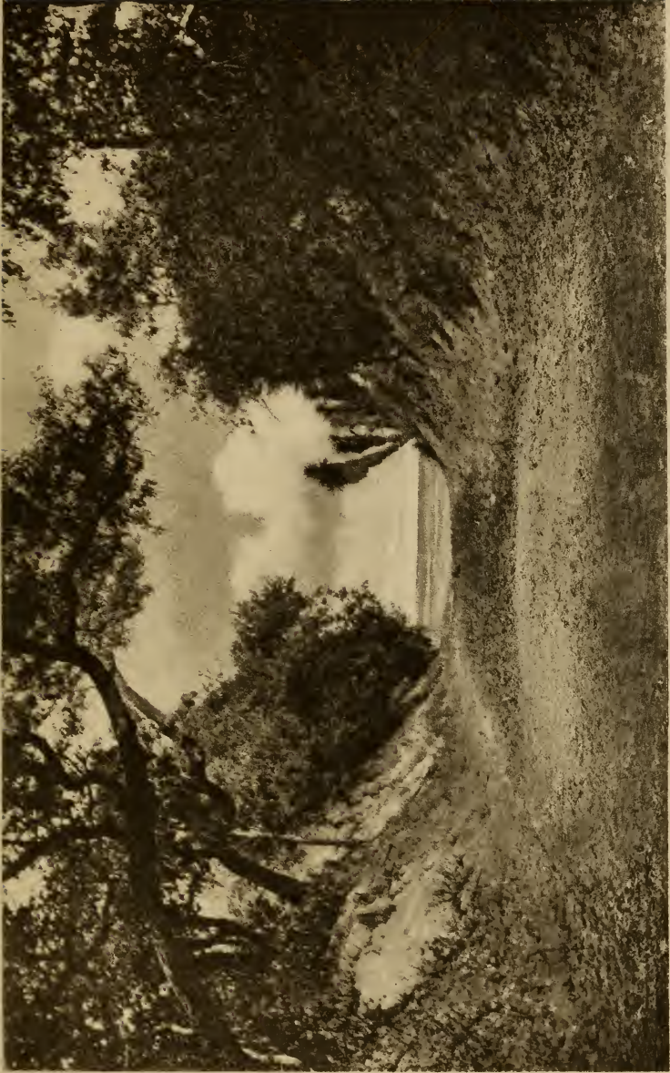
SHELL ROAD TO BEACH